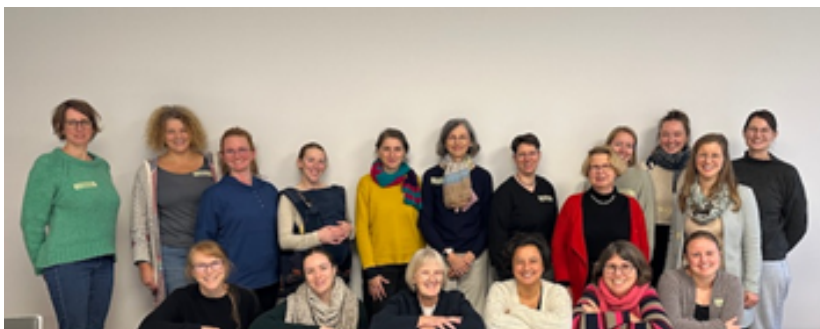
Figure 2: Working meeting in Bielefeld on November 15, 2025.