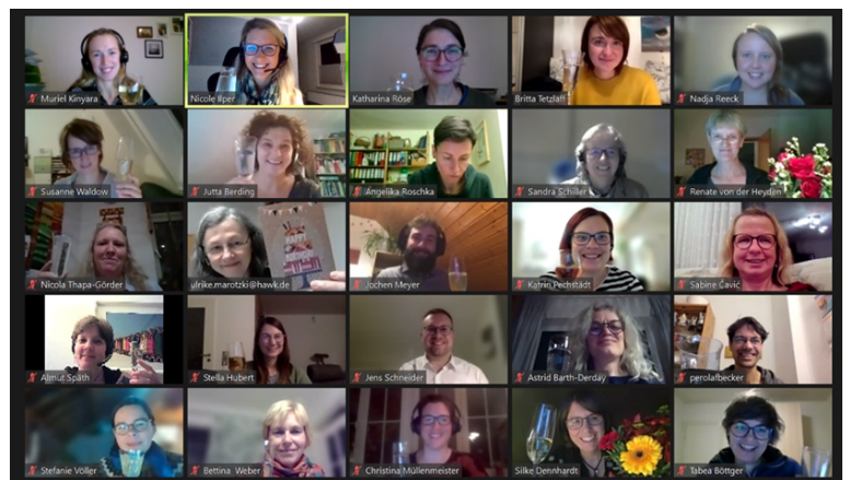
dOS meeting to found the association dOS, Zoom, November 16th, 2021

Anybody interested in more information about the dOS group or in joining the next meeting is invited to contact us via the following email address: osdeutsch@gmail.com .